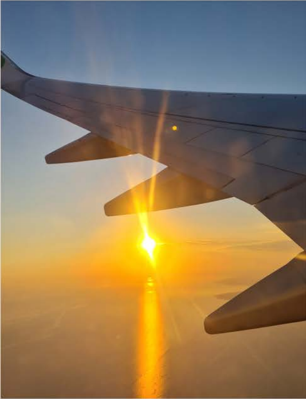
Transport to Faro Airport